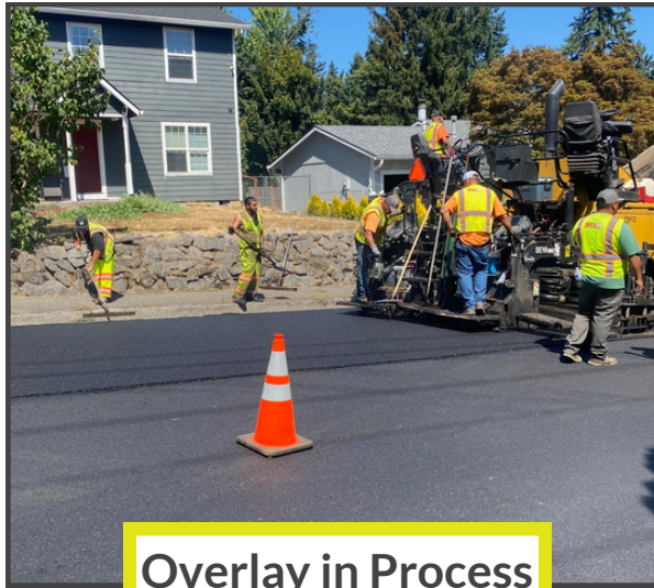
Overlay in Process