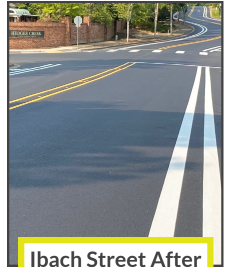
Ibach Street After