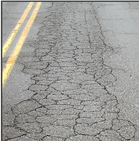
Ibach Street Before