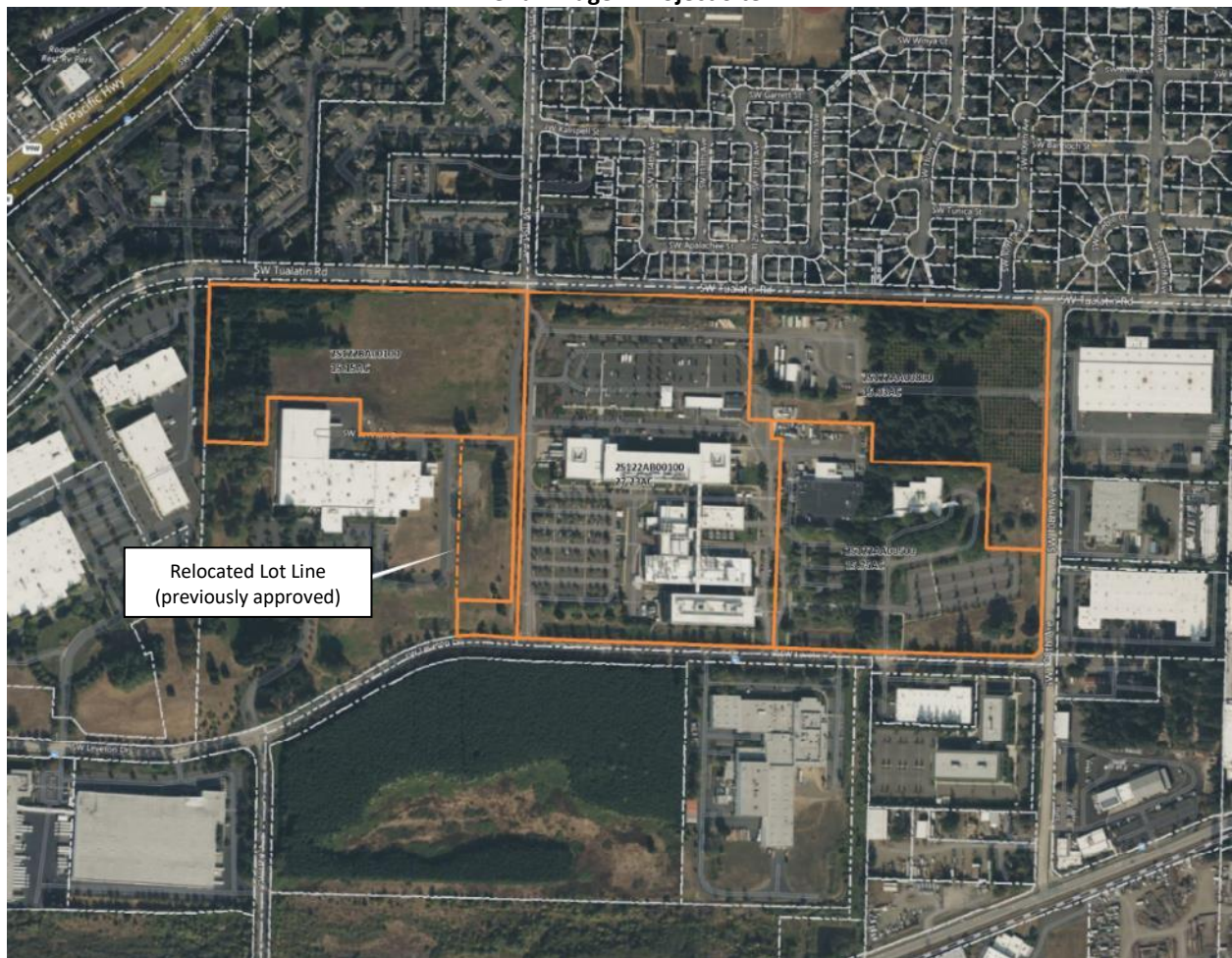
Aerial Image – Project Site