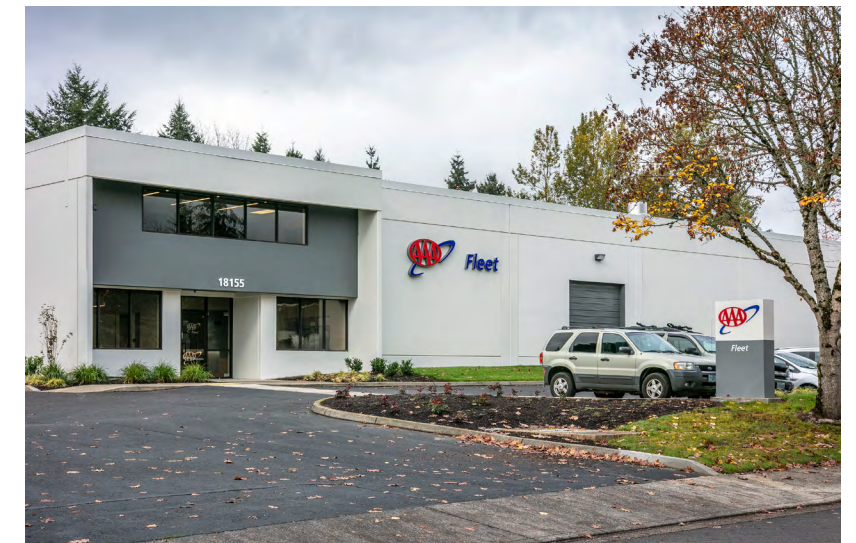
Existing Exterior Condition - No changes to the building or new construction is proposed