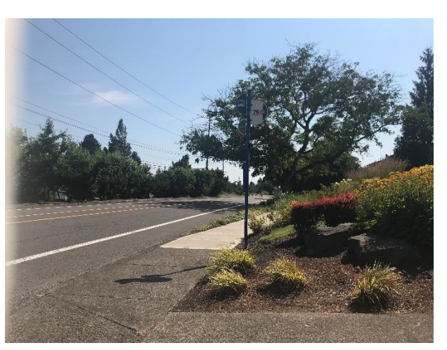
SW Sagert Street (Facing East)