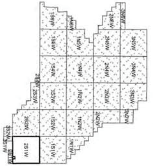
WASHINGTON COUNTY OREGON SE 1/4 SECTION 35T2S R1W1W.M. SCALE 1" = 200'