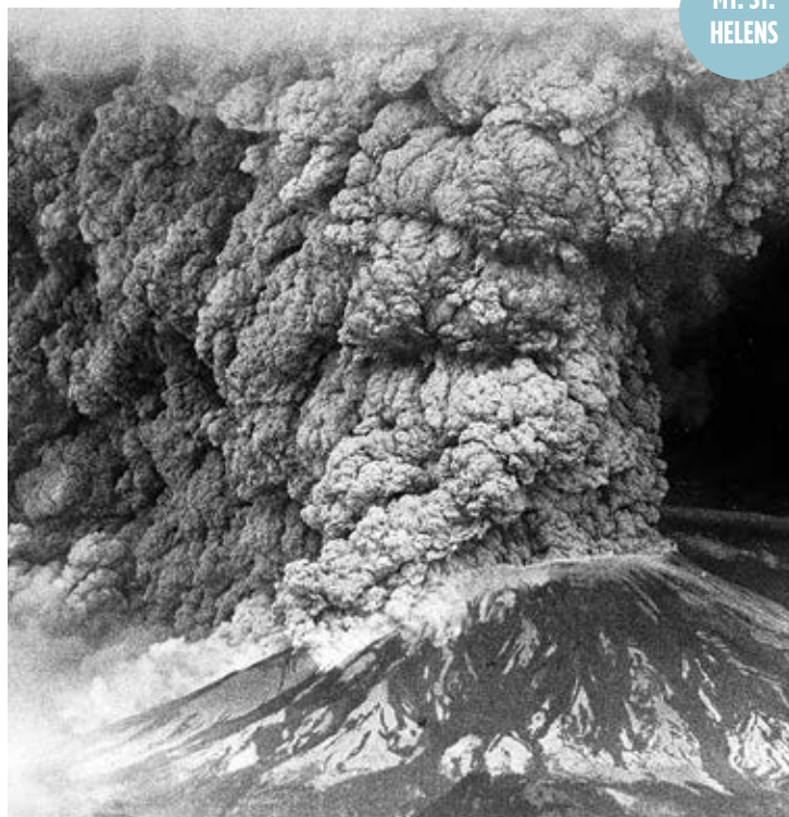
MT. ST. HELENS