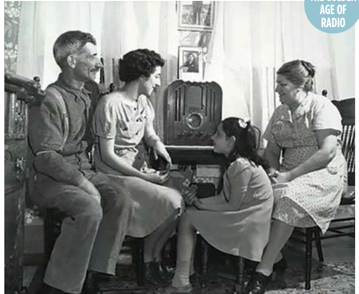
THE GOLDEN AGE OF RADIO