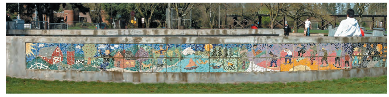
This colorful tile mural depicting Tualatin's history, is located at the entrance to Community Park, along the Park Loop. The mural measures two feet high and thirty feet long.