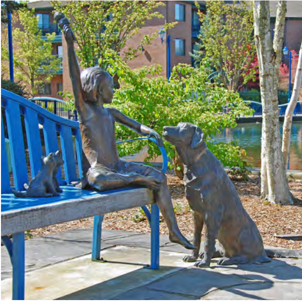
This playful bronze sculpture commemorates the site of an old pet food factory.

The Commons Loop circles the Lake of the Commons. On the route, you will visit an interactive fountain, poetry etched in stone, and whimsical bronze sculptures. Even the glass drinking fountains are works of art!