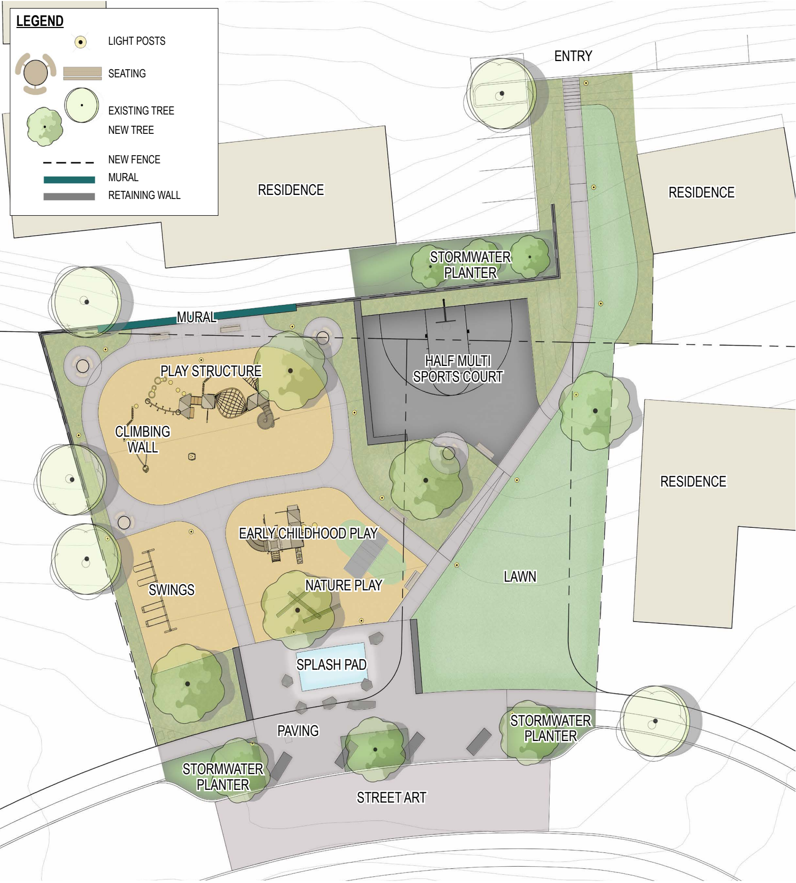
Preferred Design Option