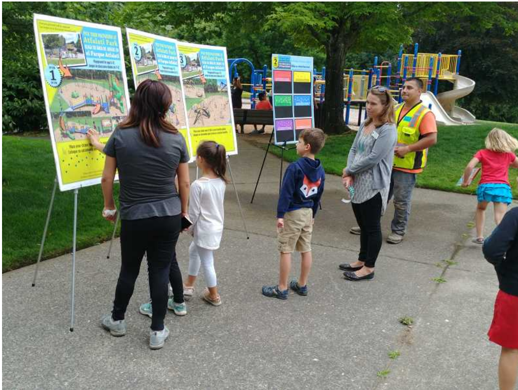
Residents look at the type of equipment they want to see installed in Atfalati Park.