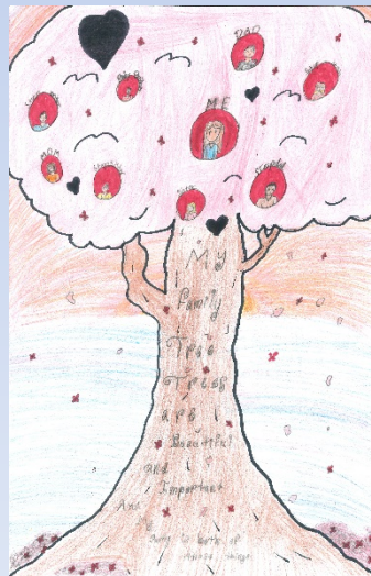
2 nd Place Payton Trees are Beautiful and Important