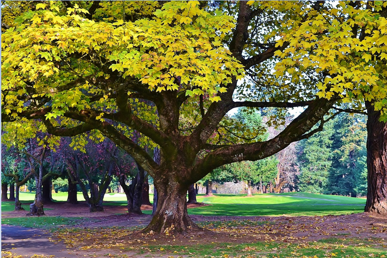
First Place – Tamera Bell The Old Man Tualatin Country Club