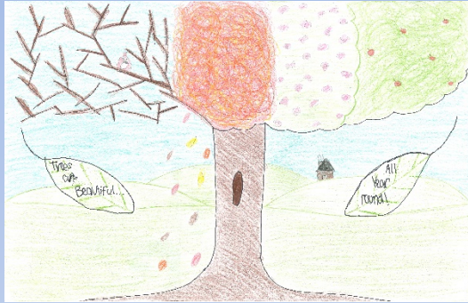
1 st Place Luke Trees are Beautiful All Year Round