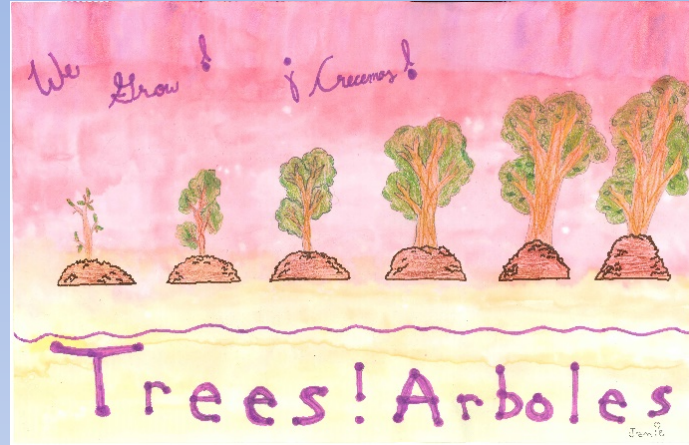
Overall 2 nd Place Winner Jamie, Bridgeport Elementary Trees Are Our Friends