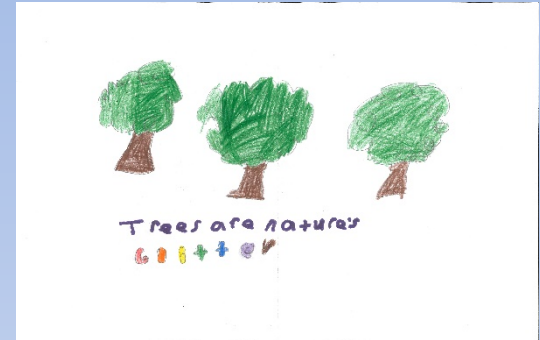
3 rd Place Taylor Trees are Nature's Glitter