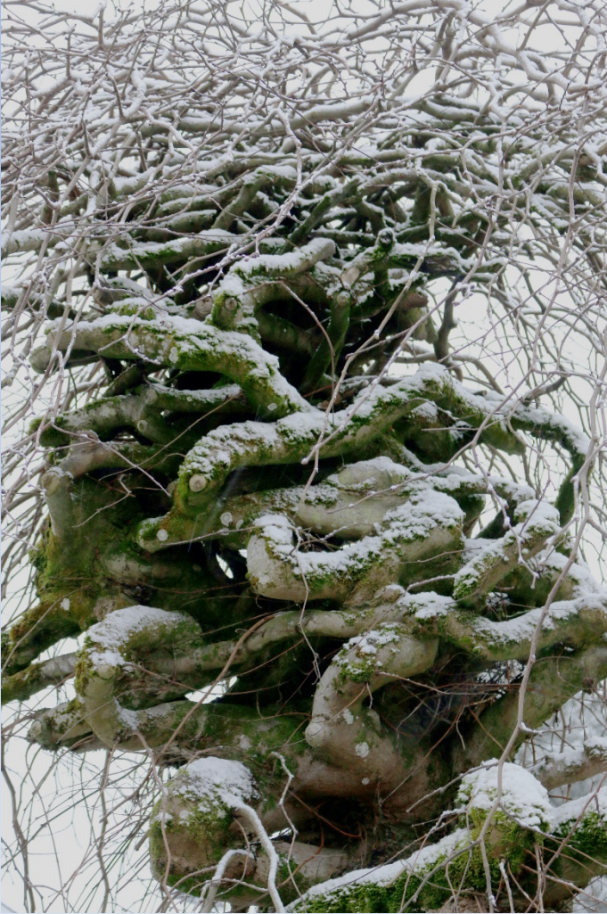
Second Place – Chad Darby Resilient Shawnee Trail