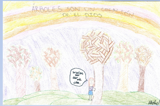
2 nd Place Rachel Trees are God's Creation