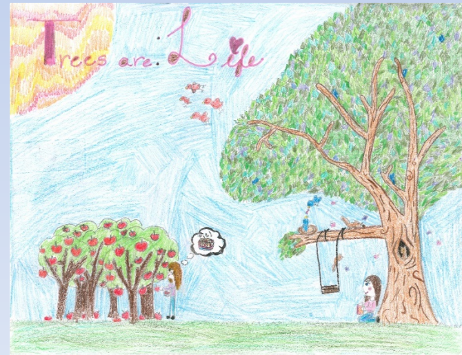
Overall 3 rd Place Winner Sophia, Byrom Elementary Trees are Life