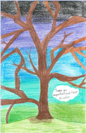
1 st Place Jadyn Trees are Important