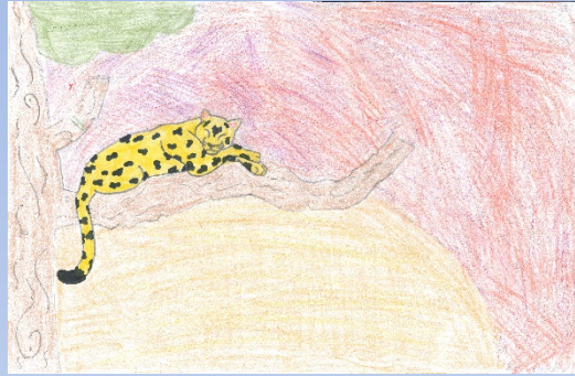
2 nd Place Mariah Trees are Home to Animals