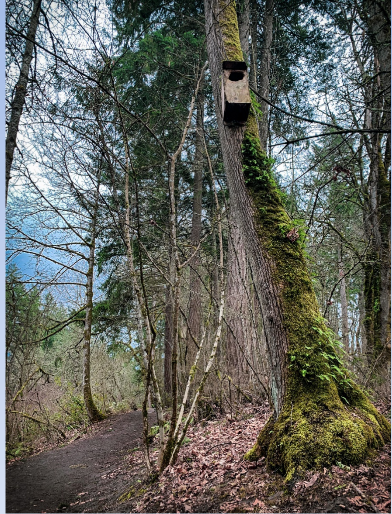
Third Place – Nils Peuser The Hermit Trail near dog park