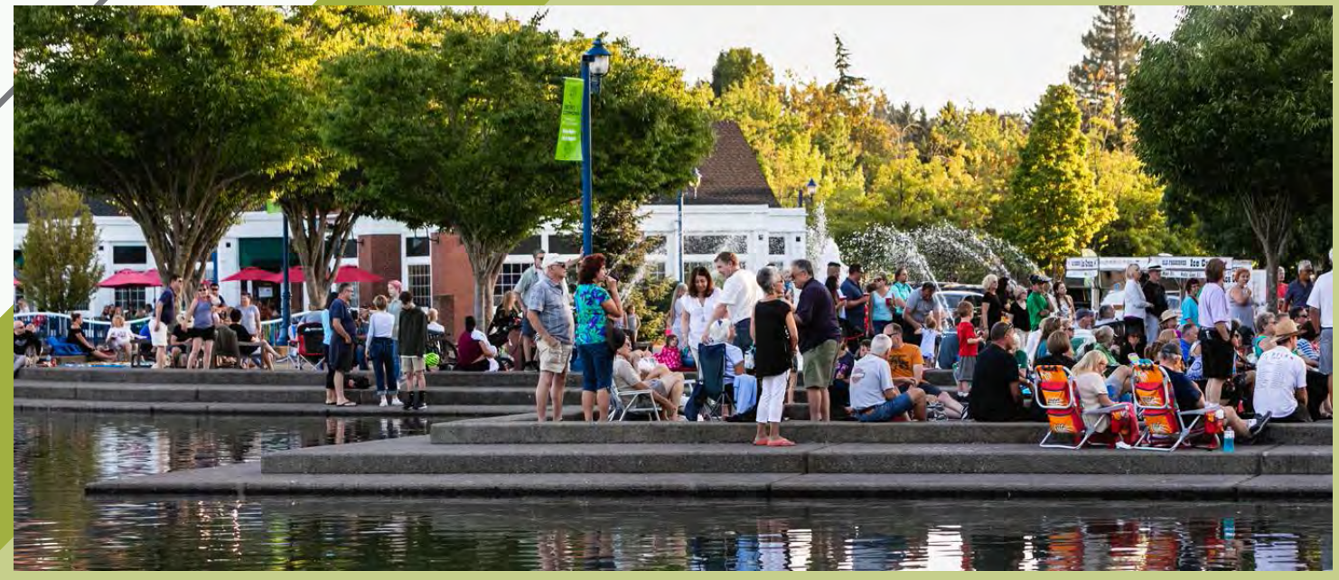
TPARK 2019 Annual Report