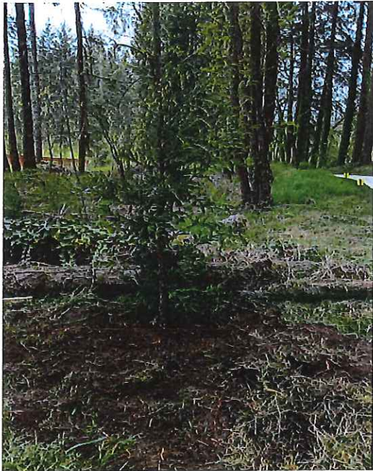
Coast Redwood #1 at Arbor Week Tree Planting (April 14, 2018)