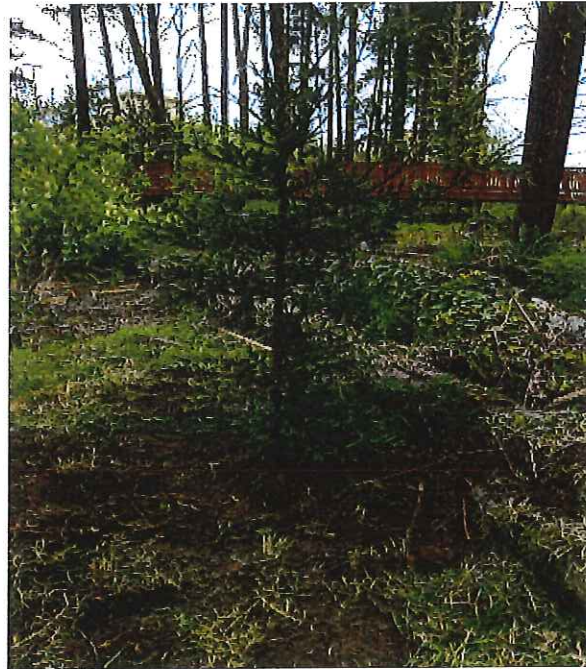
Coast Redwood #2 at Arbor Week Tree Planting (April 14, 218)

The Coast Redwoods are located east of the entrance to the Tualatin River Greenway at the Nyberg Woods connector, a City owned property in Tualatin Oregon. The trees are located on Tax Lot 02900 of Tax Map 2S124A, approximately 122° 44' 53.2104" W 45° 23' 10.7772" N.