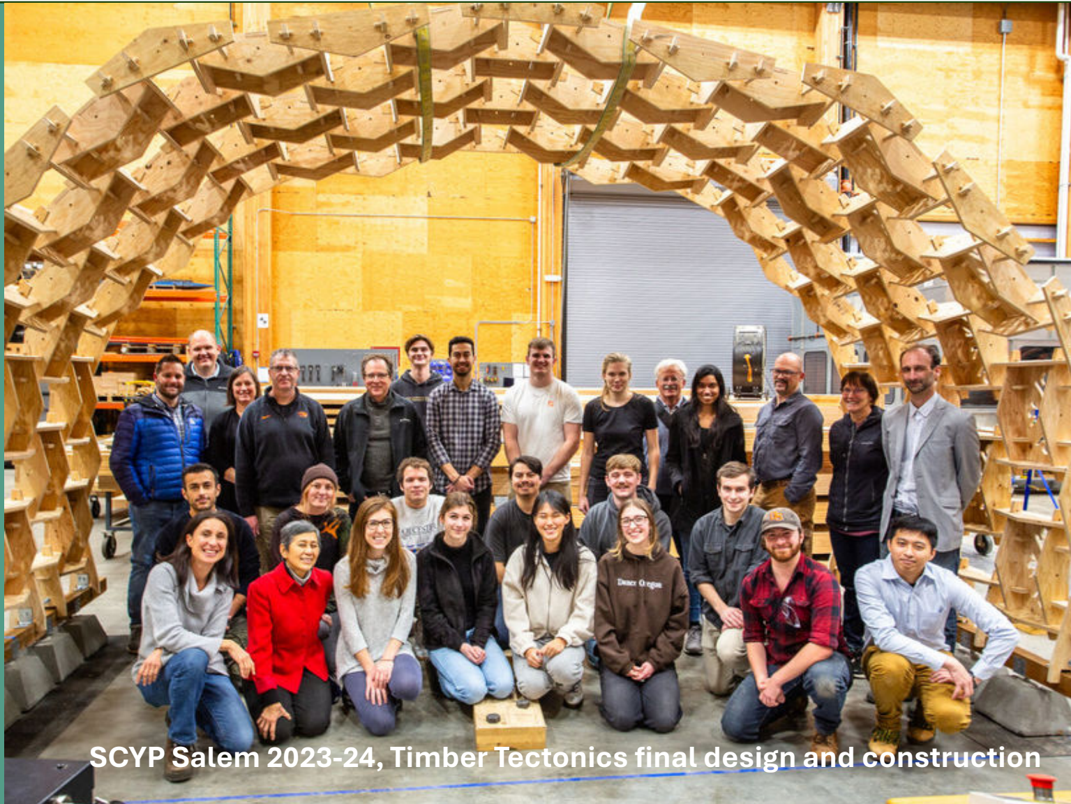
SCYP Salem 2023-24, Timber Tectonics final design and construction

We look forward to our year with Tualatin