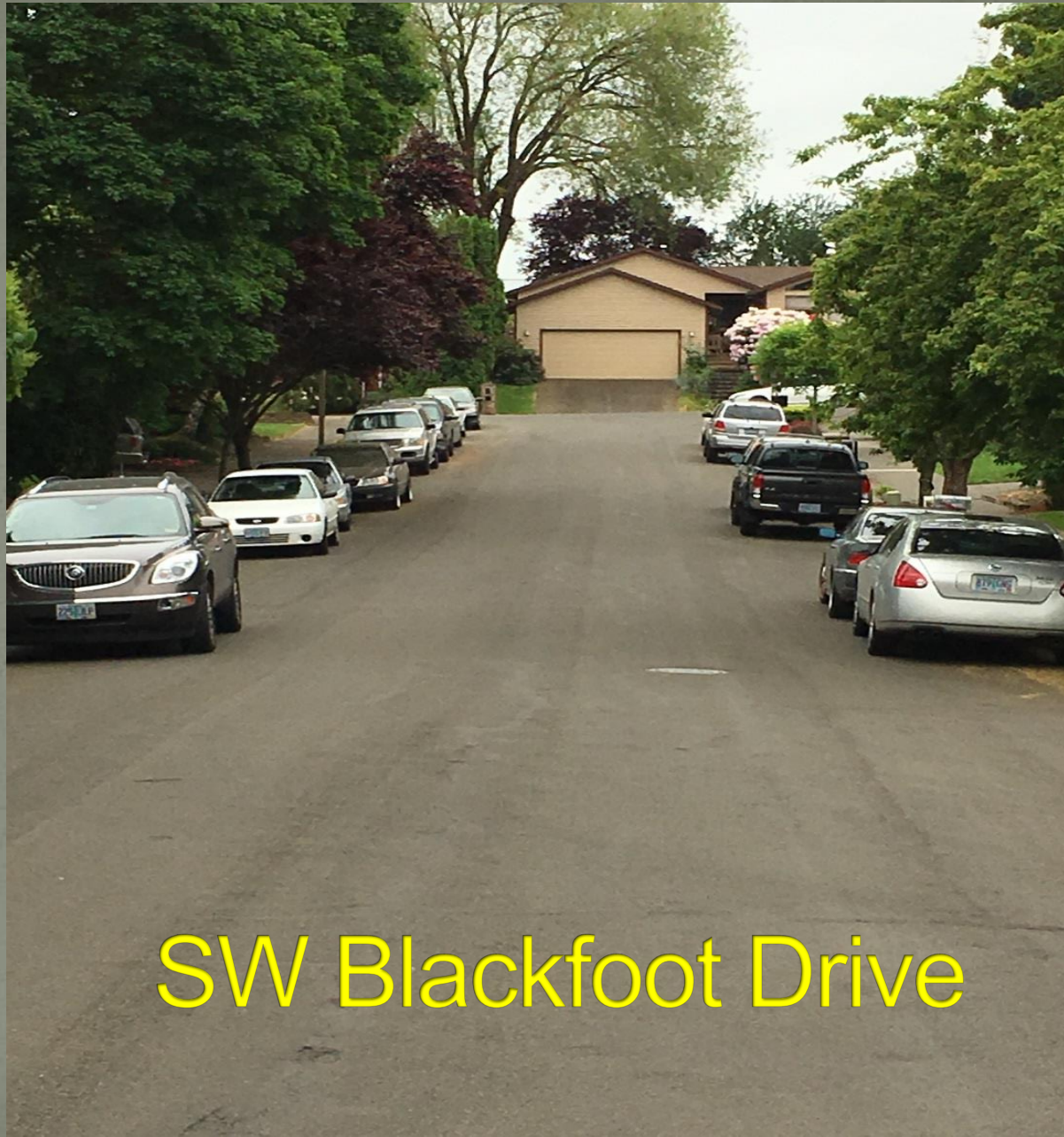
SW Blackfoot Drive