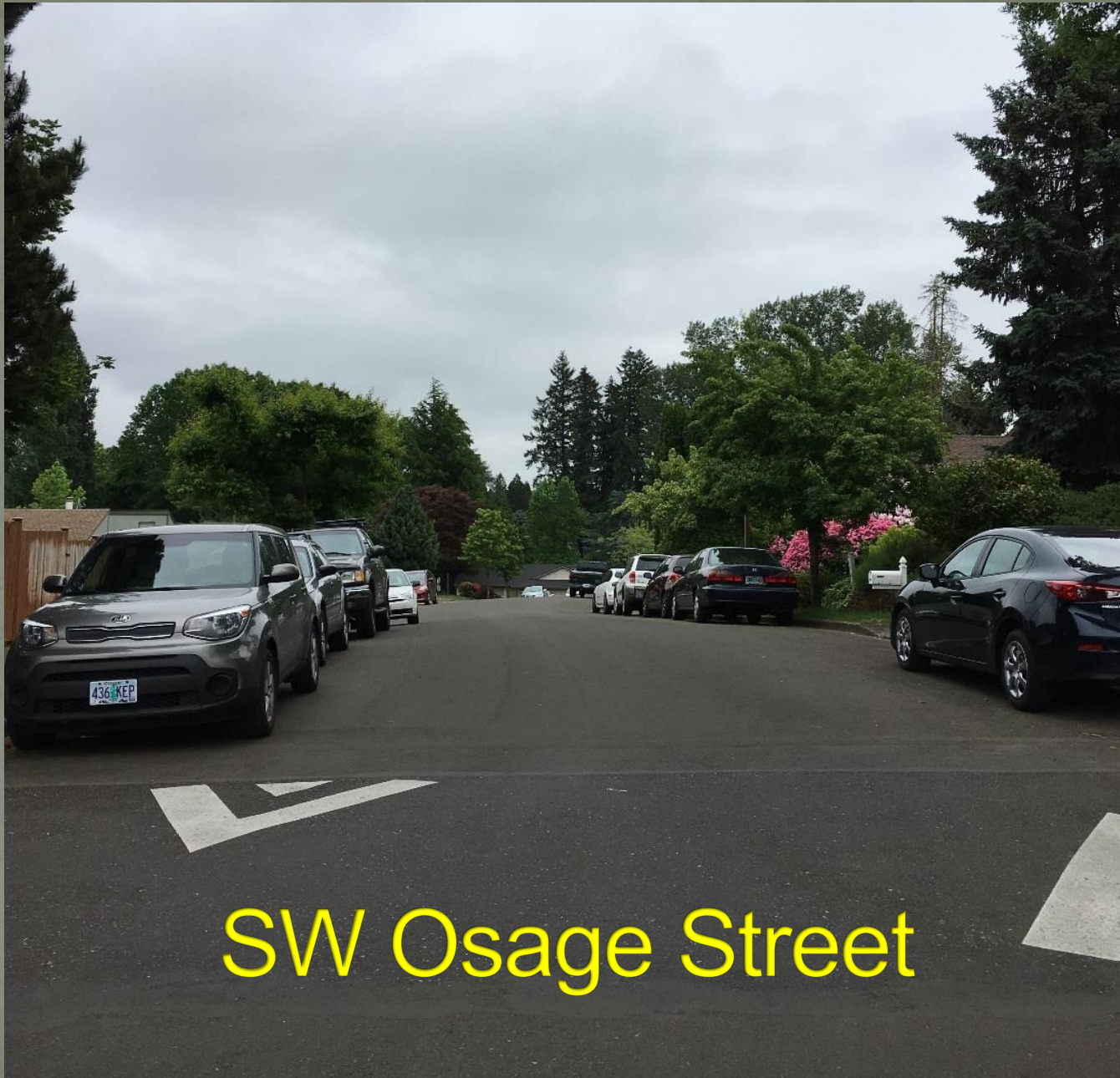
SW Osage Street