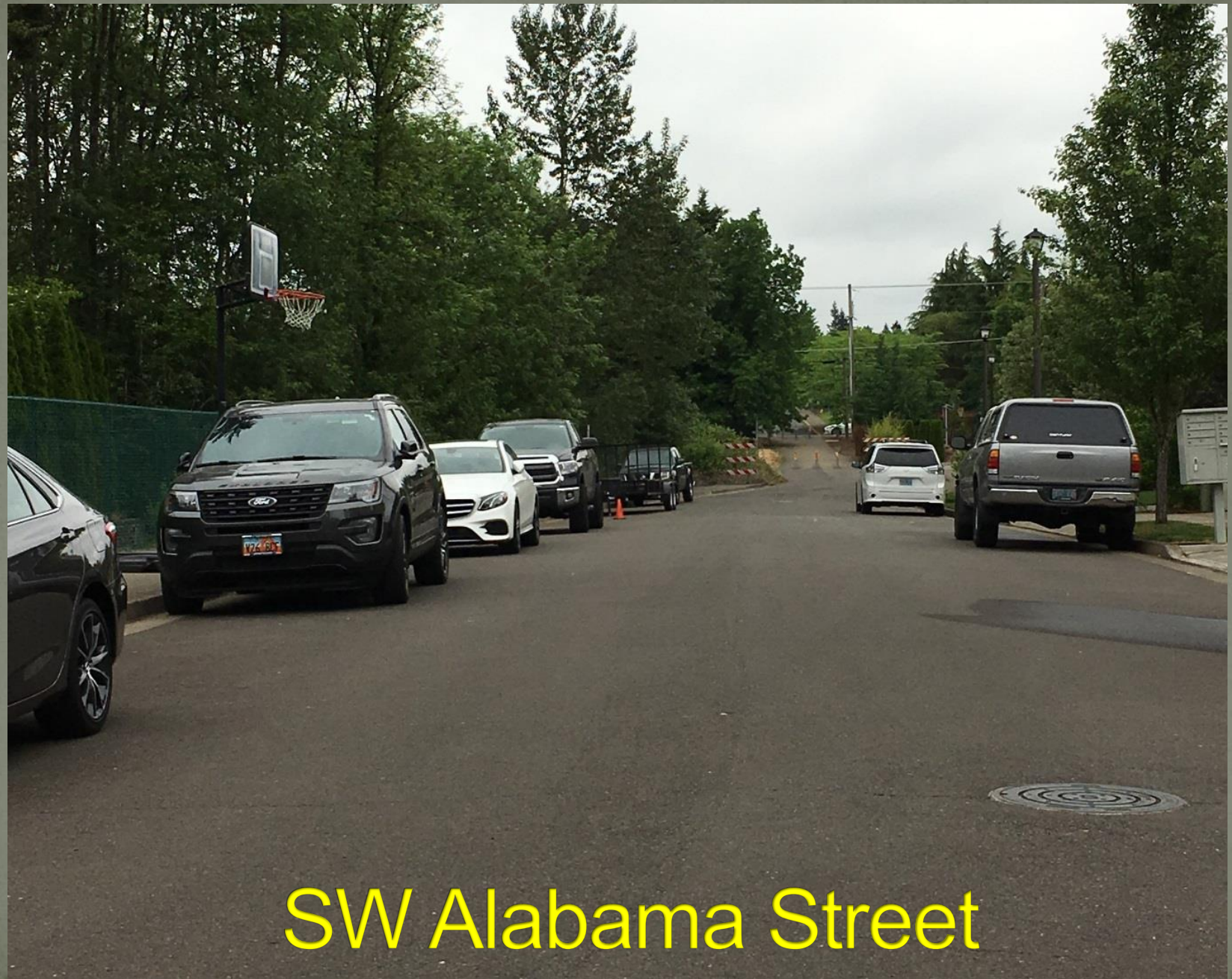
SW Alabama Street