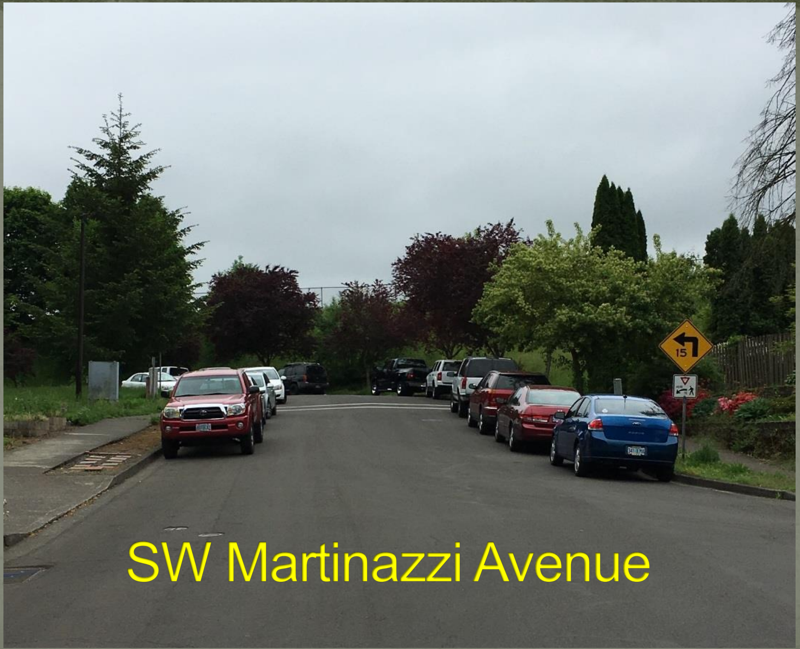
SW Martinazzi Avenue