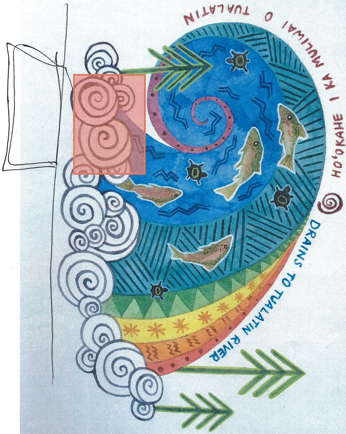
** PINK RECTANGLE DENOTES RELATIVE PLACEMENT OF STORMDRAIN IN MURAL